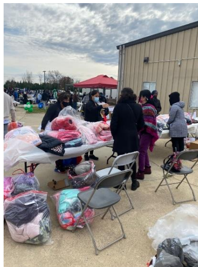
Right: Operation New Jackets 4 Kids

The second activity on the Day of Dignity was in collaboration with the League of Women Voters of Montgomery County (LWV). LWV distributed educational flyers encouraging people to vote. MEAAG distributed approximately 200 face masks and many MEAAG flyers. The partners were grateful to the ICM for the opportunity to interact with the diverse community members. MEAAG looks forward to implementing more projects with ICM and LWV.