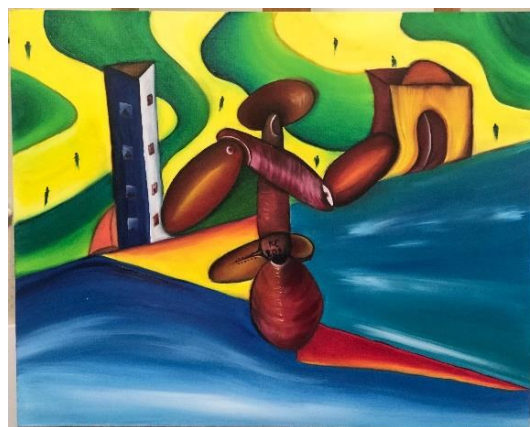
Oil on canvas~24x30~Roots~November 2021

I have within my short life with MEAAG experienced two events that were and still are meaningful, yet playful and cheerful examples of how one can experience life in this group.